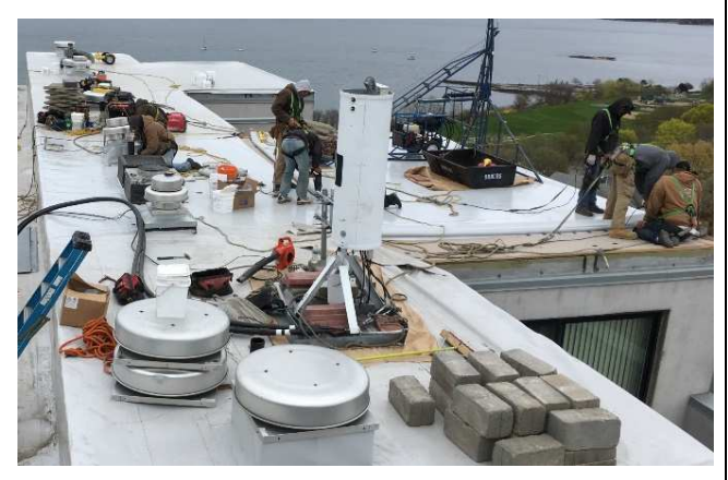
Completing Upper Section of Building 1

The winch can be seen at the top right of the next photo. Here seven workers are attaching the new roof covering and sealing around the roof openings. The new insulation and roofing material is attached to the concrete using screws and anchors and needs no ballast. All the raised curbs where fans, ducts and vent pipes exit the roof were redone and all new aluminum flashing was installed around the outside perimeter.