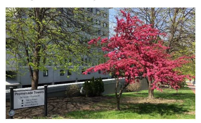
Crabapple Tree in Early Spring

When spring finally arrived, this showy crabapple tree was a welcome sight at our front entrance. Then came the blossoms on the magnolia trees and lilac bushes, the colorful rhododendrons by the pool and a variety of flowers all over our property.