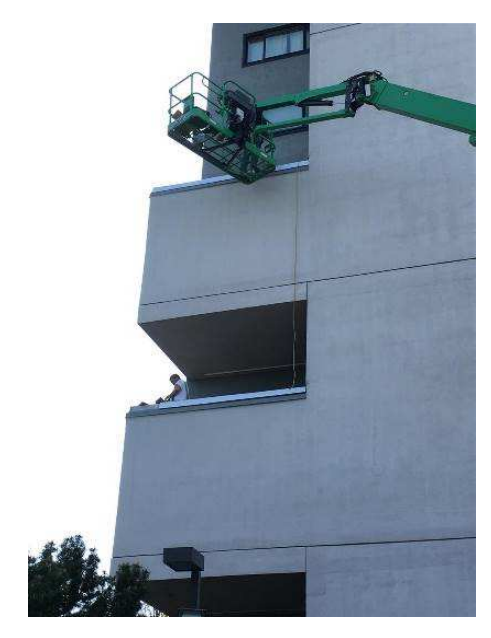
Building 1 Stairwell Roofs

Building 1 and 2. While most of these are small areas, they are logistic challenges; plus the level of flashing/trim requires lots of time and plenty of attention. All the old debris and new materials were transported from/to the roof projections using the lift. The largest of these areas were the connectors between Building 1 and 2 around the elevator shaft and center stairwell. This required the lift to be