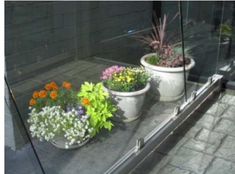
Fall Arrangements at the Front Entrance