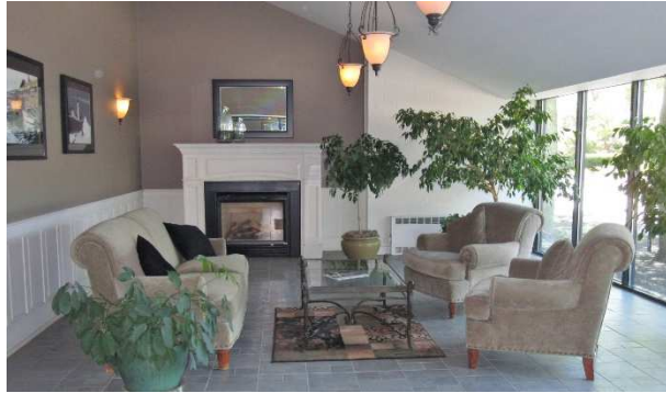
Front Lobby at Promenade Towers

Okay, we'll miss the summer season, hanging out at the pool or just admiring it from our windows. But how about those fall colors! Some of us who don't head south as winter approaches kinda like being here as the seasons change and even look forward to the first snowfall.