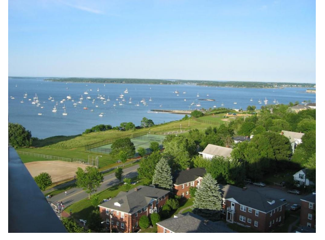
View of the park from Promenade Towers

Location, location, location! For springtime activities, you couldn't ask for a better location than Promenade Towers on the Eastern Prom. Soon we'll open our windows to enjoy the fresh air and the sounds of cheering fans and ball players in the park across the street. Some of our residents will be playing tennis or shooting baskets on the courts next to the ball field, riding bikes and hiking along the Eastern Prom Trail or taking a picnic to East End Beach.