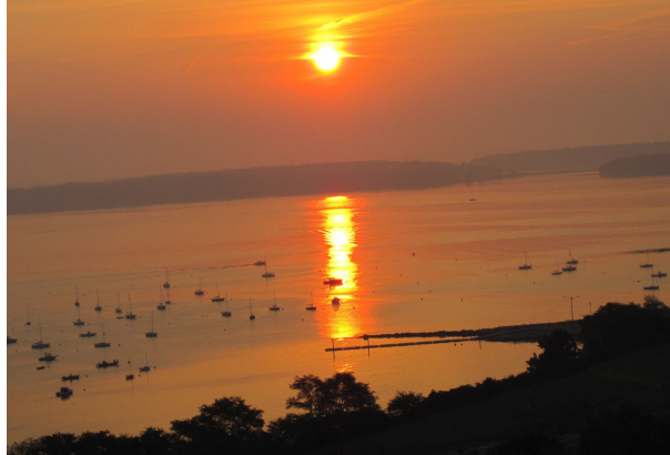
Sunrise View from Promenade Towers

Our residents and guests enjoy some of the finest views in Portland from Promenade Towers. Now people all over the area can share these spectacular views thanks to a camera that WGME Television station recently installed on our roof. If you watch Channel 13 News or go to their web site, www.wgme.com and click on SKYCAMS, you may see Fort Gorges, Back Cove, lighthouses, sailboats on the harbor, cruise ships or downtown Portland—wherever the camera is pointed.