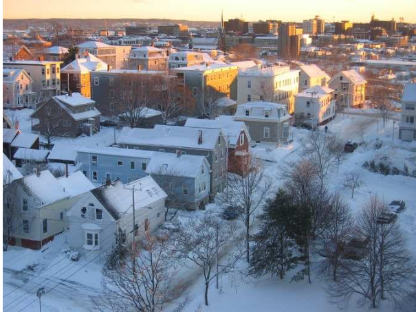
Neighborhood view from Promenade Towers

Though some of our residents have flown south for the winter, most of us stick around to enjoy the season. We miss the fall colors and the summer days by the pool, but we like what winter has to offer here in Maine and in our own neighborhood.