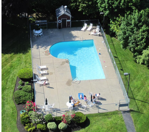
Memorial Day at the Pool

Do you recall this famous quote by football quarterback Joe Namath? “I can’t wait until tomorrow ‘cause I get better looking every day.” Promenade Towers is like that. Well, maybe not every day , but at least every year if you listen to residents who have been away for the winter. “Everything keeps looking better,” they say.