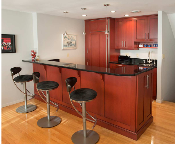
A Renovated Kitchen at Promenade Towers

When owners at Promenade Towers consider renovations, it's helpful for them to see other condos here that have been renovated. Thanks to a new feature on our website, they can view renovated units without leaving their computers. The above photo of a renovated kitchen is one of many in a collection that can help new and potential owners visualize the possibilities.