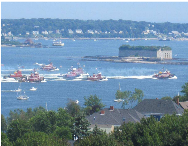
Tugboat Race in the Harbor

The above photo of tugboat races, Fort Gorges and islands in the background was taken from our building. Last spring the Maine Sunday Telegram referred to our East End neighborhood with water