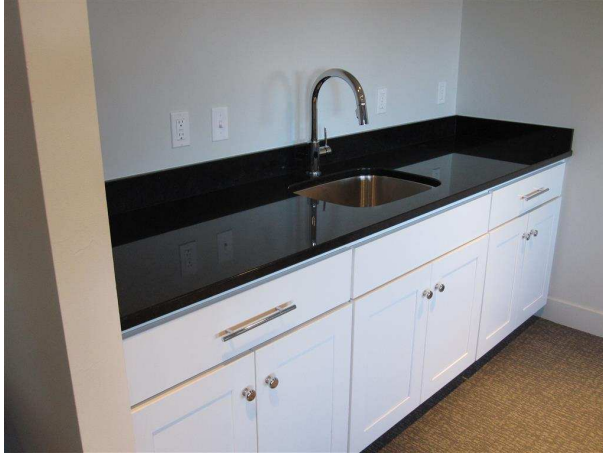
Community Room Kitchen Area

If you haven't seen the Community Room since the completion of the renovation project, stop by and check out the transformation.