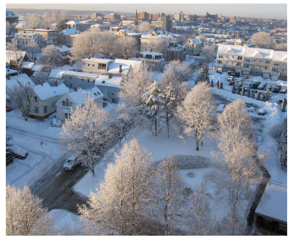
View from Promenade Towers on a Snowy Day

Doesn't the snow in the picture above look pretty? Not much fun, though, was it? The snow, the ice, the wind, the sub-zero temperatures!