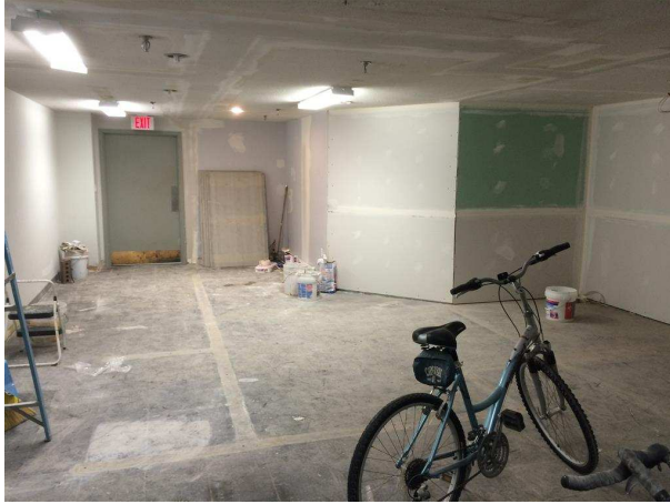
Bicycle Storage Room Coming Soon

With popular trails nearby, it's no wonder that more and more of our residents own bikes. Portland is a bike-friendly city, and some new condo developments include bicycle storage in their plans. Many existing condo associations don't have the space to add this amenity, but fortunately, we do have the space to convert to a bicycle storage room.