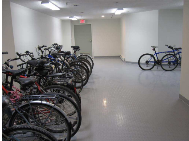
Another Great Amenity at Promenade Towers

What a makeover! Compare the room in the above photo with the “before” photo below showing the room when the project was just getting started. See the saunas on the left and some of the lockers on the right?