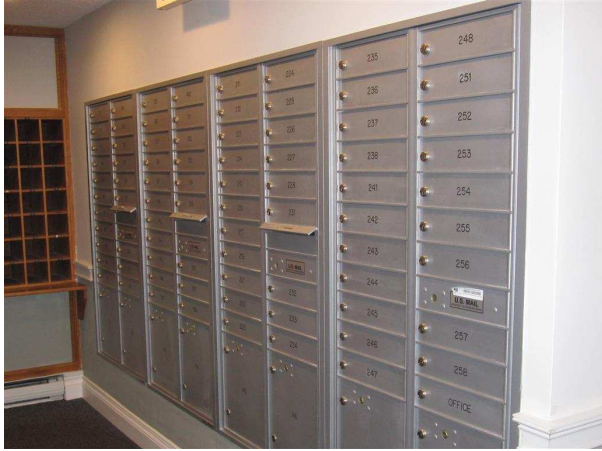
New Bigger and Better Mailboxes

No more whining from the mail carriers who had to stuff mail in the old narrow mailboxes. And no more complaints from residents who had to struggle to dig their mail out of the boxes. The new mailboxes have been installed, along with brighter recessed lights in the mail room.