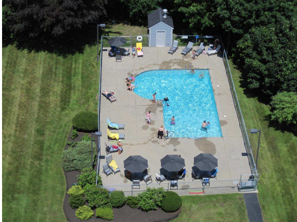
Fun at the Pool Last Summer

It wasn't such a bad winter, was it? Won't it be nice, though, to have green leaves on the trees, a beautiful lawn and a sparkling pool again? All the colors in this photo make me smile.