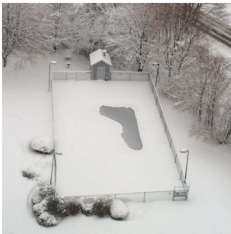
Map of Florida on Our Pool Cover

The picture below of the same view is not a black and white photo; it was just a black and white cloudy day. We looked out that morning and saw Florida! Did anyone else see the outline of Florida where the snow had melted on the pool cover?